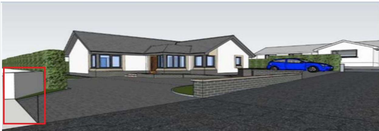
Figure 5 (page 10 of the Appeal Statement)

We also noted that Figure 5 on page 10 (snippet below for ease of reference), shows the front corner of the land as part of Mr Graham's property. As noted in our previous correspondence this is part of our property. We are re-including an extract of the land registry document dated 21/12/2021, hereunder